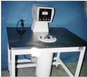
Manual Counting Station

Step 5 - The devices are removed from the tank and taken to a counting station where they are measured for Kr85 gas that may have leaked into a device through a defective hermetic seal.