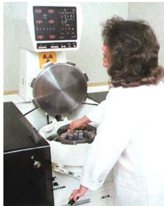
Loading parts into vertical pressurization tank

Step 1 - Devices are placed in metal baskets or fixtures, and the baskets placed inside of a pressurization tank, the tank lid closed and locked and the console cover closed.