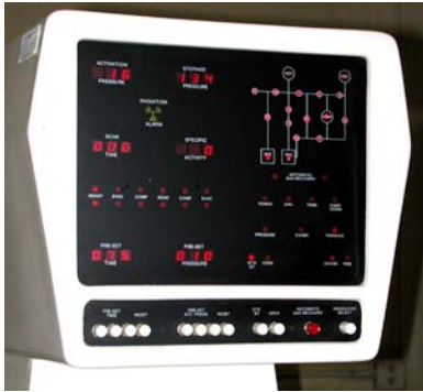
Operator Control Panel

Step 2 - The pressurization system is programmed for the pre-calculated pressure and time required to achieve the desired leak rate sensitivity, following the Radiflo equation.