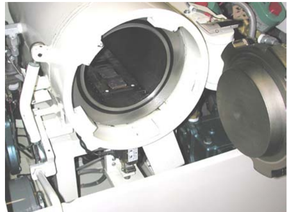
Parts placed in horizontal pressurization tank

The chamber configuration of 'Horizontal' or 'Vertical' is chosen to assist in handling of devices. Many devices are conveniently handled in baskets, (in bulk), some may require custom trays to prevent the leads on electronic devices from being damaged from handling, and others are handled in 'tubes' or 'sticks', from fabrication through testing.